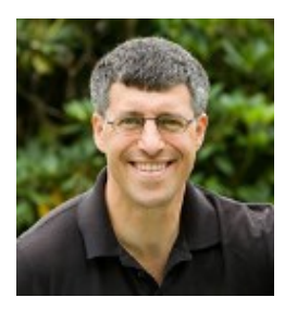
Thursday October 27th at 12:00 pm

Hope to see you then for delicious soup and current event discussion. We are always looking for volunteers to provide soup and bread....or sandwiches....and a cookie type dessert.