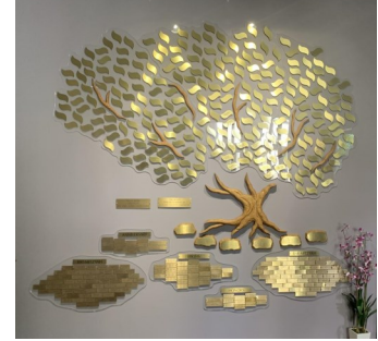
Tree of Life

To discuss other recognition opportunities, please contact: