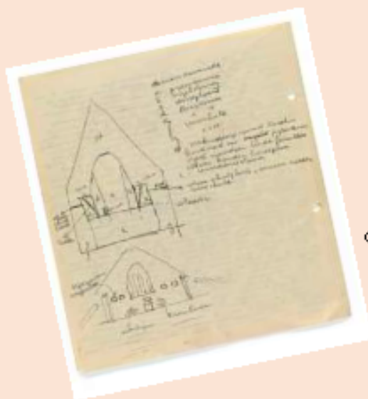
← Chaim de Zoete's drawing of the attic hiding place, describing the Breeplein Church raid, December 29, 1947