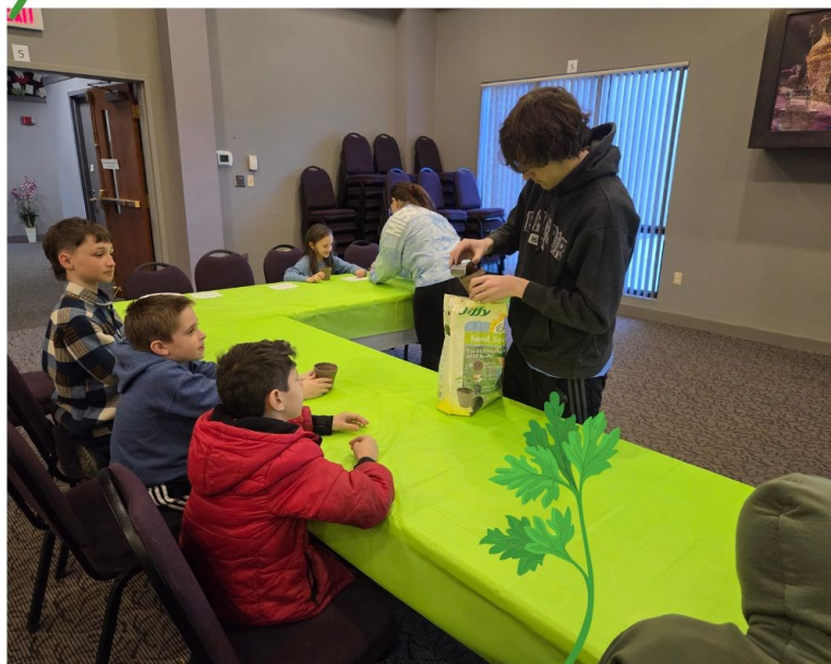
Our religious School students celebrated Tu B'Shevat by bringing a variety of fruits to learn the significance of the holiday while enjoying sweet treats and time together at TBH.